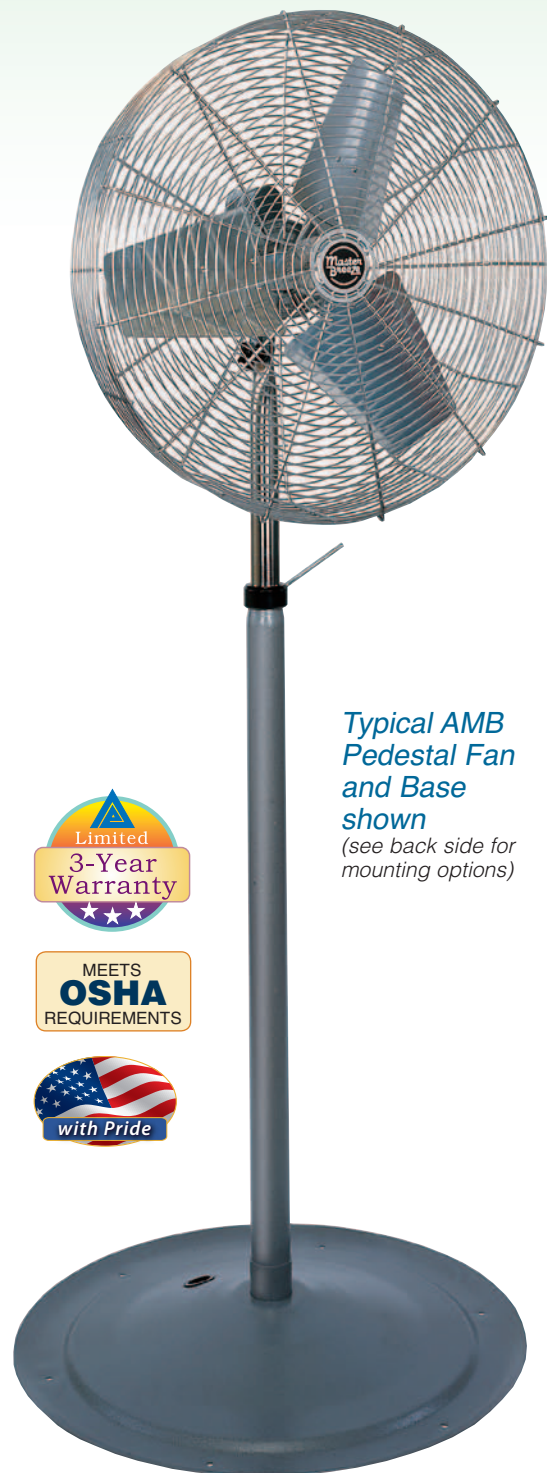
Typical AMB Pedestal Fan and Base shown (see back side for mounting options)

24" and 30" Industrial Grade Fans and Accessories